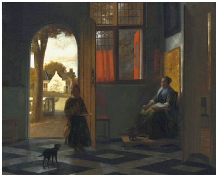
Pieter de Hooch, A Woman Seated by a Window with a Child in the Doorway (c.1663).