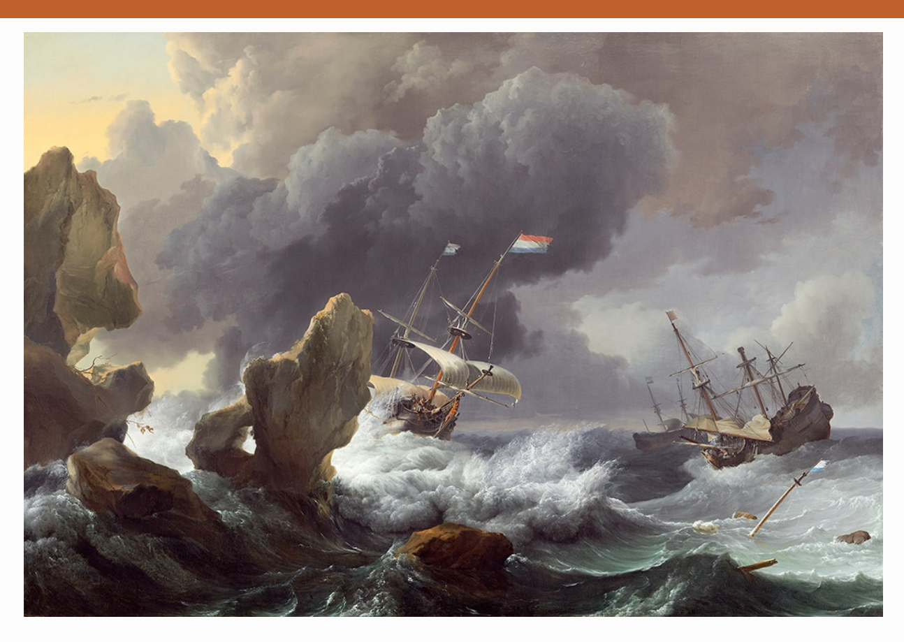
Ships in Distress off a Rocky Coast by Ludolf Backhuysen, 1667

Shipwreck and Salvation - The Wreck of The Prince Maurice 1657 by Toya Dubin