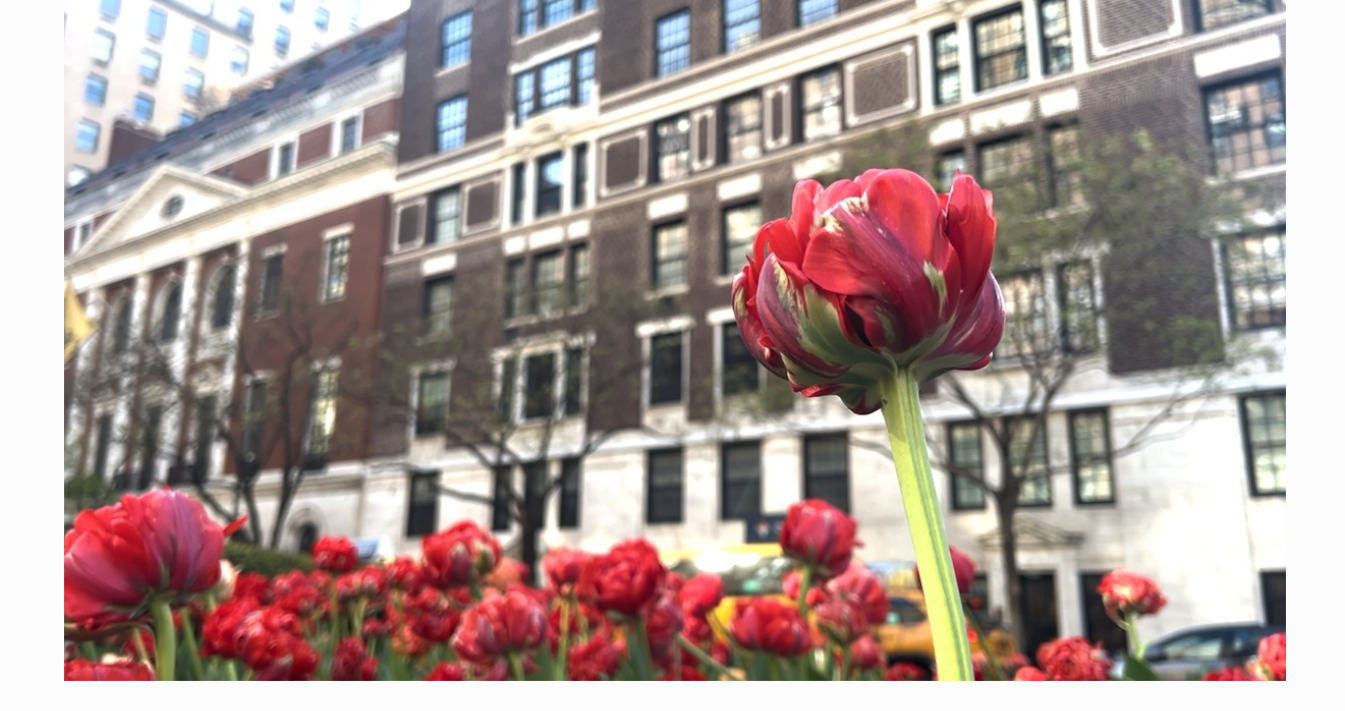
Dutch Orange Balloon and Peony-Flowering Tulips

The Statue of Liberty, Central Park, the High Line, and the Park Avenue Malls. What do these New York icons have in common? All four faced an uphill battle before becoming an indelible part of the city. And those battles took vision, persistence, serendipity, philanthropy, and luck.